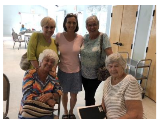
Visitors from Bourne & Wareham

We believe that some other locations for Paper Pantries have been opened. We believe that one has started in Wareham. Others, like St. Peter's, Osterville, may be starting as well. (continued on next page)